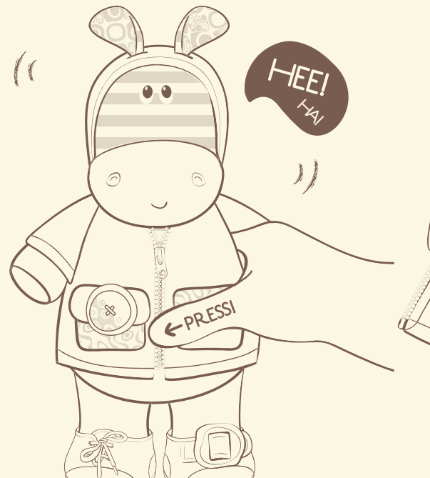
Press Zebb's tummy to see him wiggle n' giggle!

Zipper here. Button there... A giggling and wiggling dress up buddy to take anywhere.